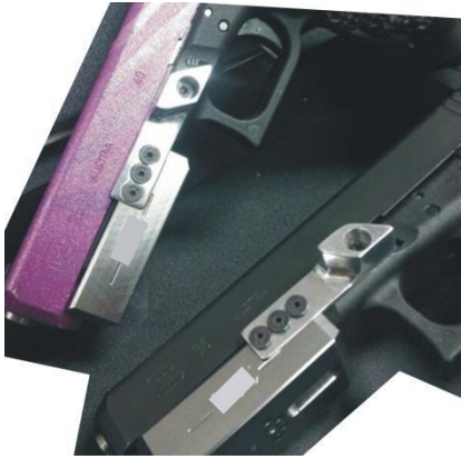
A weight is attached at the frame